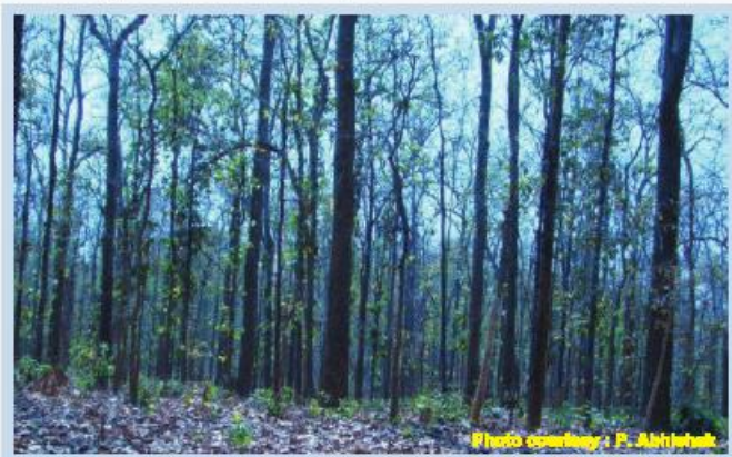
A Shorea robusta plantation at the stage of flushing

Sal regeneration (Troup, 1986; Tewari, 1995). Sal forests are being managed under both high forest and coppice system (Troup, 1952; Champion and Seth, 1968b). Selection, clear-felling and shelter-wood systems are practised under high forest systems. On the other hand, methods such as simple coppice, coppice-with-standards, coppice-with-reserves and selection coppice are practised under coppice systems. At several instances, improvement felling and climber cutting are being carried out to improve stand development.