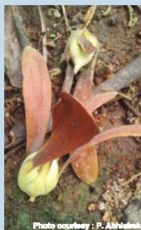
Winged fruit of Sal

Sal seeds shed from parent trees at a high moisture content of 42-50%. The recalcitrant nature of Sal seeds excludes all traditional methods of storage. Also there is no dormant or resting period for the seeds and they germinate soon after they mature. The recalcitrant seeds possess a very short viable period. Freshly collected Sal seeds lose their viability in just 6-7 days after harvest when stored at ambient or at 15° C. However during the viability period, seeds exhibit almost 100% germination. Chaitanya and Naithani (1998) observed that Sal seeds when treated with 10 ppm kinetin (maintained at 15° C) showed 100% germination up to 10 days compared with 3 days in controls. Moreover at similar conditions the viability can be made extended up to 35 days, but the germination is reduced to 20%. This prolonged viability is attributed to reducing the loss of seed leachates and enhancing superoxide dismutase activity by the kinetin.