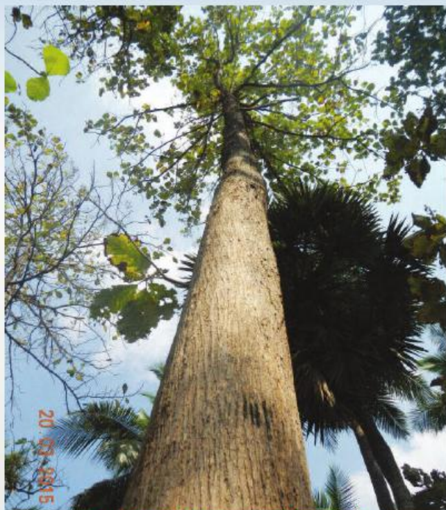
Teak CPT-26, Valasakkadu valkal In Pattukkottai Range