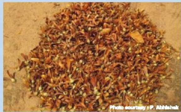
Harvested seeds of Sal

Seeds germinate in nursery under warm and moist conditions in 7-10 days after sowing. The root to shoot ratio is very high in S. robusta . At initial growth, Sal seedlings have shoot to root ratio of 3:1 and after five months it is 6:1. Usually such root colling may cause damages to root. Hence in order to prevent root damage, germinating