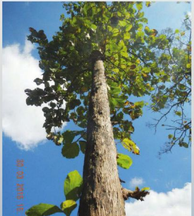
Teak CPT-20, Pandalyar In Thiruvarur Range