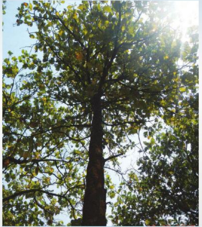
Teak CPT-4, Nadupadukal In Thanjavur Range