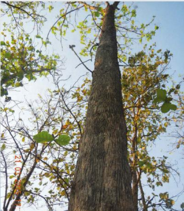
Teak CPT-14, Puthur vakkal In Mannarkudi Range