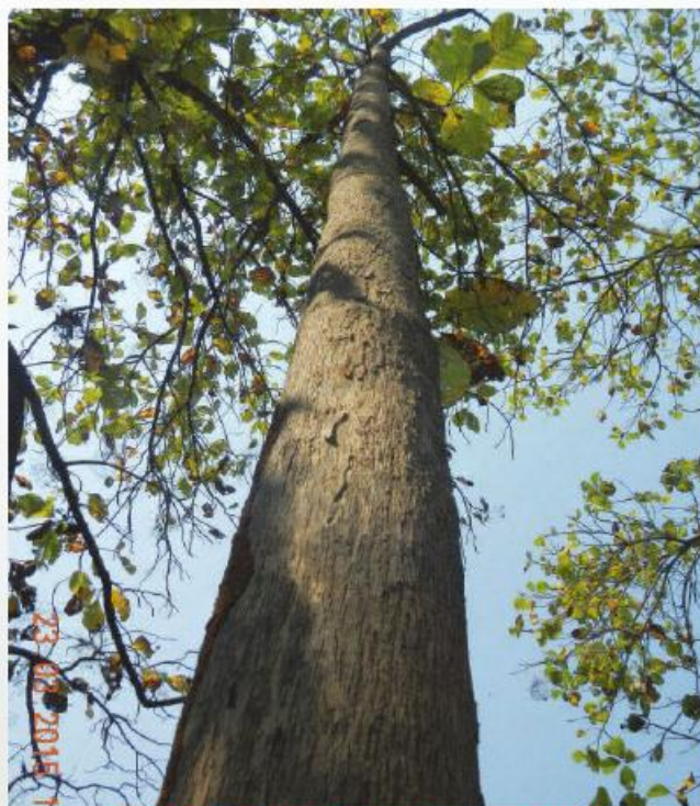
Teak CPT- 89, Pudupattinam valkal In Pattukkottai Range