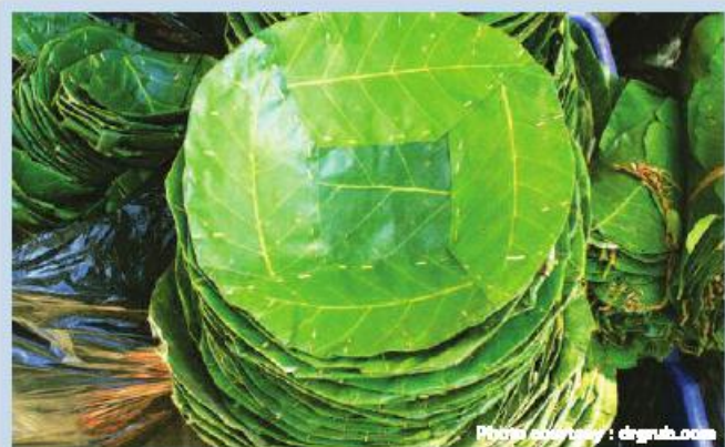
Plates made from Sal leaves

Sal is highly valued for its timber. Its heartwood is hard, heavy and dark reddish-in-colour. The wood is highly durable and resistant to termite attack. The wood grain is strongly spiralled and structured coarsely. Though the wood is easy to saw, the high resin content makes it difficult to plane and turn. Rarely, it has tendency to split when driven by nails. During the past few decades, Sal forests witnessed huge deforestation as the wood was chiefly used for making railway sleepers, ship-building and other construction purposes in our country. The wood is also used for poles, railway ties and posts, household interiors as window frames, floors and for many other applications.