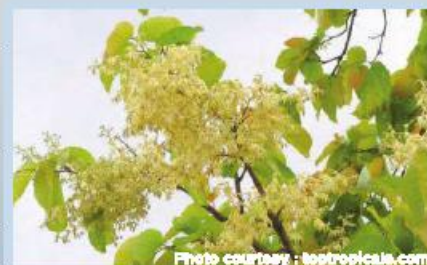
S. robusta in full bloom

S. robusta is anemophilous (pollination by wind) exhibiting an explosive pollen release mechanism. This is highly supported by several characteristic features of wind