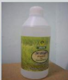
N fixer (Product)

Frankia inoculated Casuarina tree showing root nodules at the basal region of the trees